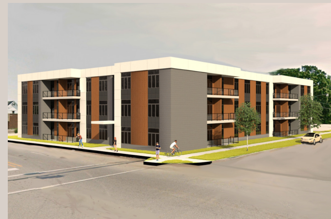
THE BRICKSTONES AT RIVERBEND

In February, Anawim Housing was presented with a $400.00 check from United Healthcare Community Plan to be used towards transportation vouchers for our program tenants. Anawim Housing is grateful for United Healthcare’s support and partnership as we work together to aid in the lives and personal journey of our program tenants.